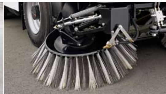
Side brush tilt

A third brush can be added to the Bucher CityCat 5000. This makes it easy to clean around obstacles or on two levels and significantly extends the CityCat 5000's sweeping path.