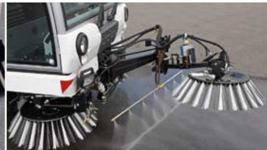
Street wash system

The weed brush is the environmentally friendly solution for removing weeds, pulling and sweeping them up in a single pass without the use of chemicals.